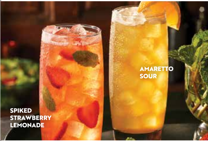
SPIKED STRAWBERRY LEMONADE

Bacardi Silver rum and amaretto mixed with strawberry-passion fruit. 14.49