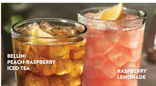
BELLINI PEACH-RASPBERRY ICED TEA

Lemonade, sparkling water and strawberry-passion fruit. 5.49